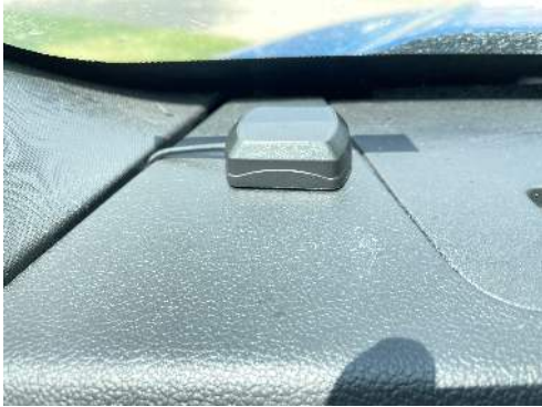
GPS Mounting Location on Vehicle Dash

Below are example mounting locations. The key for the antennas is a clear sightline to the sky for an optimum signal. Run cables back to your DashCam.