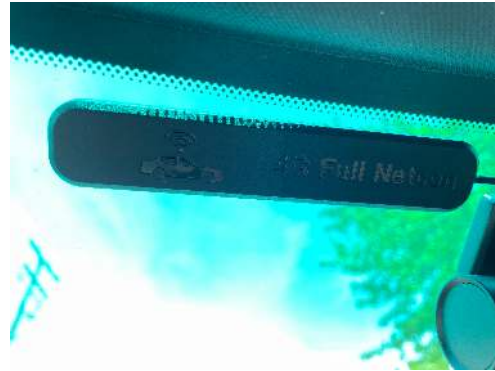
4G Antenna Mounting Location on upper windshield